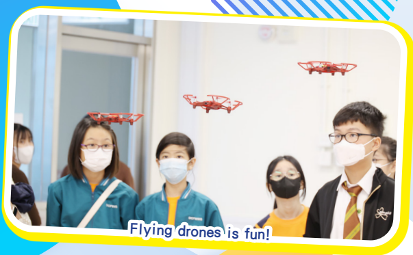
Flying drones is fun!