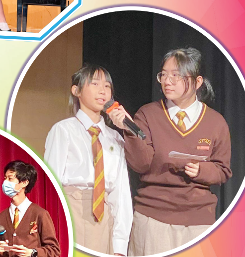
A breathtaking gig!