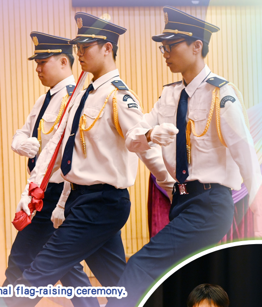
National flag-raising ceremony.