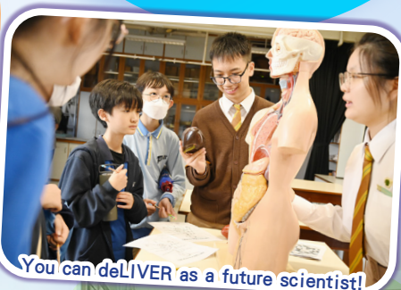
You can delIVER as a future scientist!