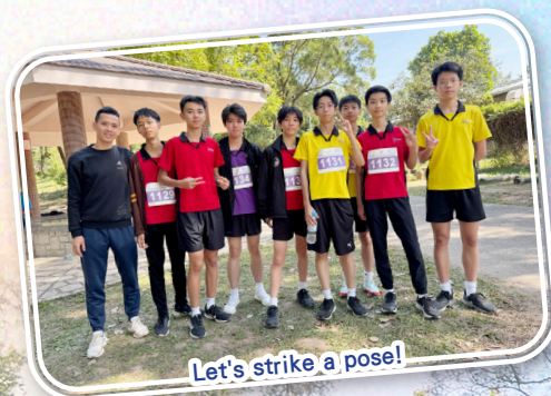
Let's strike a pose!