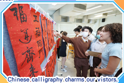
Chinese calligraphy charms our visitors.