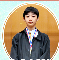
Our Grade C Sabre Champion!