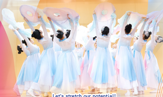
Let's stretch our potential!