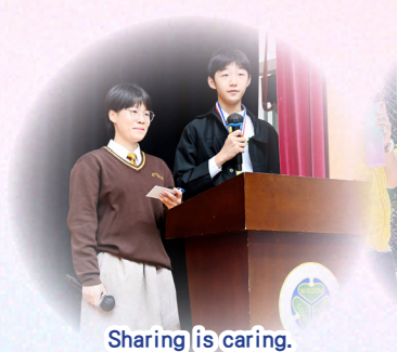
Sharing is caring.