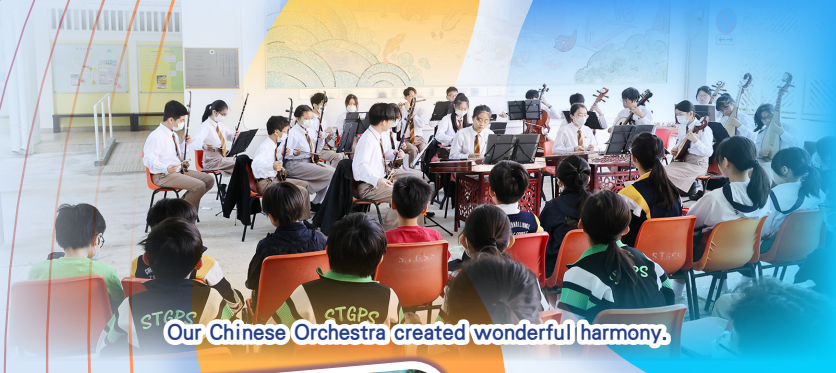
Our Chinese Orchestra created wonderful harmony.