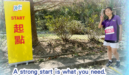
A strong start is what you need.

The Schools Sports Federation of Hong Kong, China Shatin and Sai Kung Secondary Schools Area Committee Inter-School Swimming Championships 2023-2024