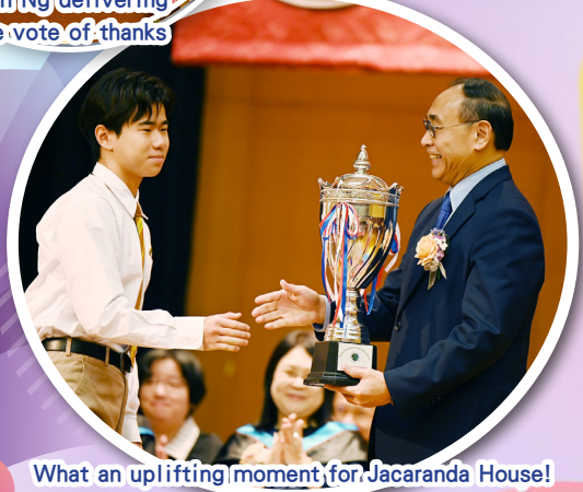
What an uplifting moment for Jacaranda House!