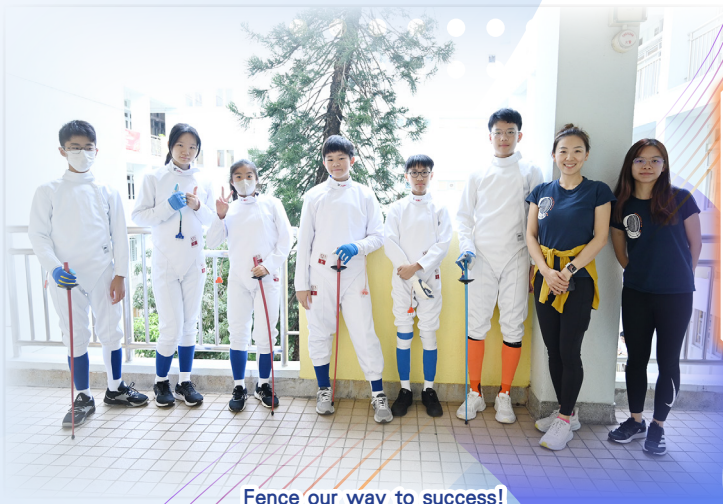
Fence our way to success!