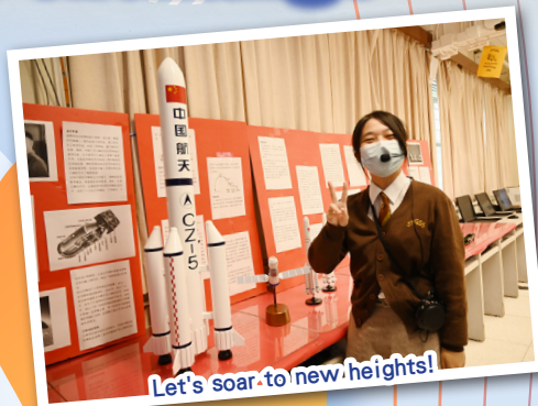
Let's soar to new heights!

To sow the seed of commitment to a sustainable lifestyle in primary students, our student ambassadors demonstrated the concepts of Hydroponic Farming, Organic Farming and Waste Collection projects to our guests at our Green Life Cube.