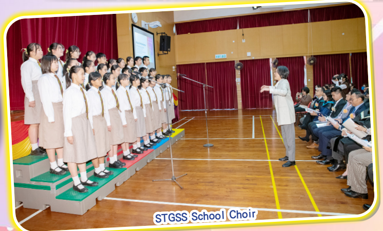
STGSS School Choir