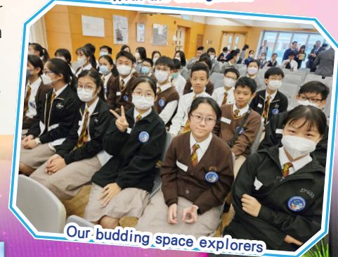
Our budding space explorers