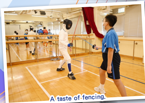
A taste of fencing.