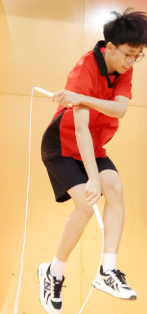
Leap, froze and dazzle.