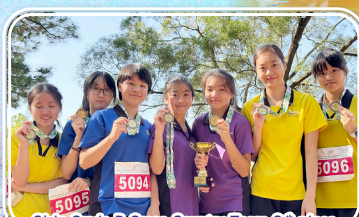
Girls Grade B Cross Country Team 8 th place