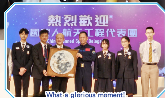
What a glorious moment!

Such a precious experience enabled them to take one step closer to their dream so as to contribute to the country and humanity in the future.