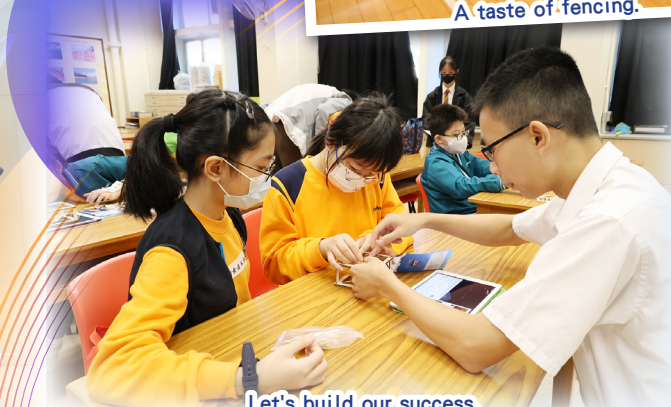
Let's build our success.