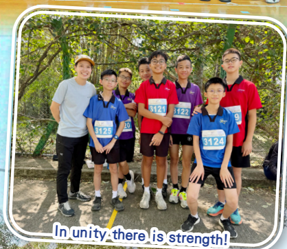
In unity there is strength!