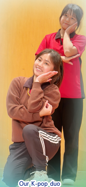
Our K-pop duo