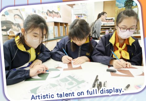
Artistic talent on full display.