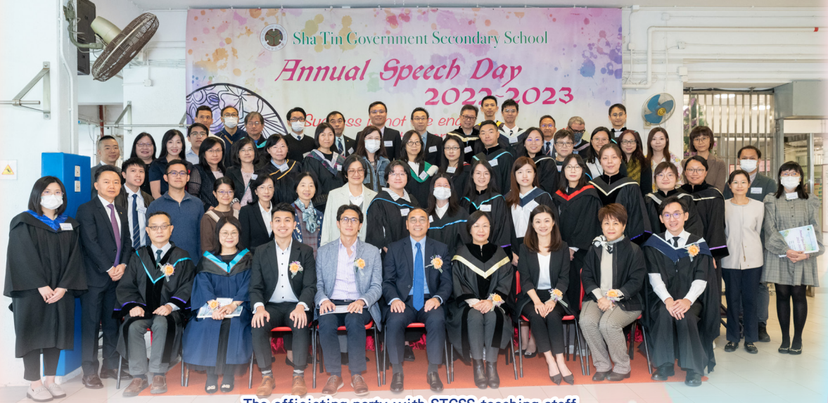
The officiating party with STGSS teaching staff.