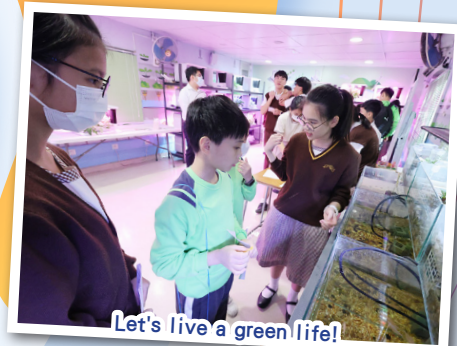
Let's live a green life!