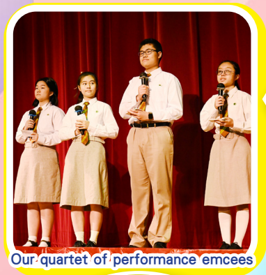
Our quartet of performance emcees