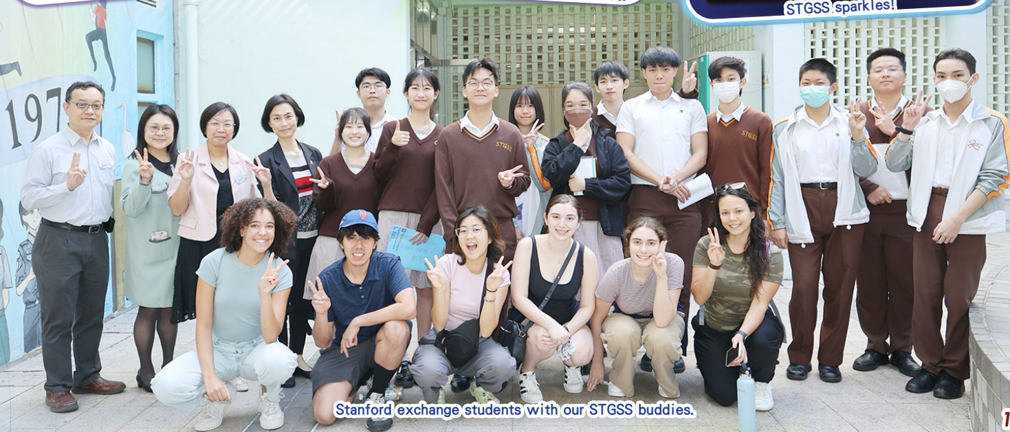
Stanford exchange students with our STGSS buddies.