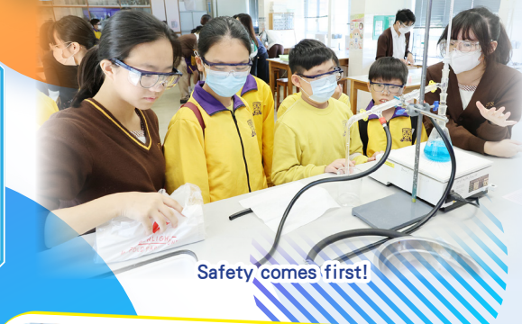
Safety comes first!